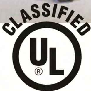
6000 Series (1 Hour Fire Resistance)